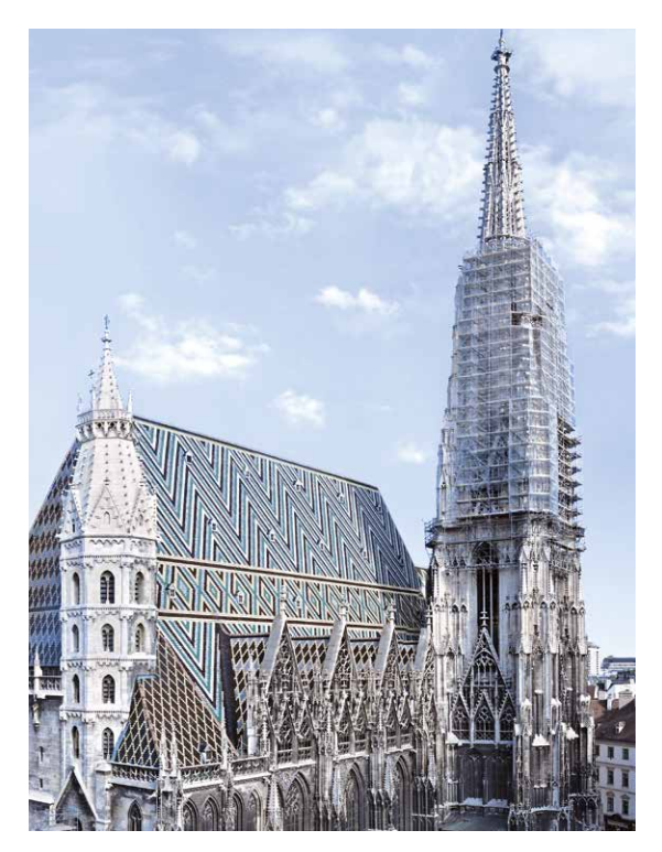
We used a bespoke modular scaffolding system for St. Stephen's Cathedral in Vienna which was erected around the building without the use of anchors