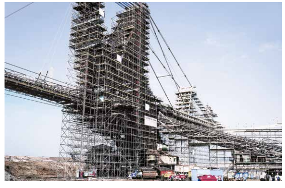
The majority of major projects need special constructions; moreover we are able to supply large quantities of material at very short notice