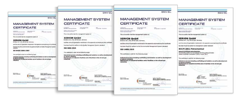
The certificates are valid in conjunction with the main certificate

The high safety standards, which apply to our staff, are, of course, also valid for the area of subcontractor management. We work exclusively with reliable, accredited and inhouse approved partner firms who we are sure can fulfil our quality standards. Moreover, we use an SAP-based system that continuously monitors all parameters required for the accreditation and informs us of any deviations.